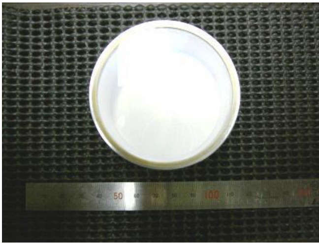
View of packaged single crystal grown via H-01