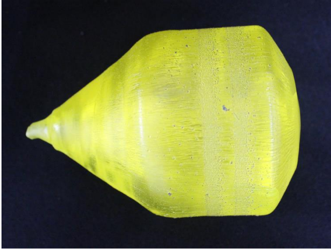
Fig.1: Photograph of 3-inch-diameter GAGG scintillator. *1

*1 Kamada et al., J. Cryst. Growth, 452 (2016) 81-84.