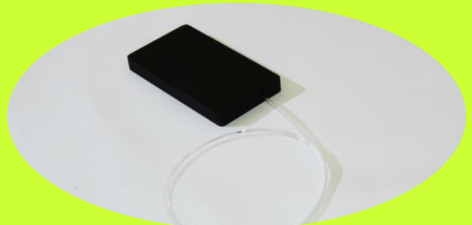
Smart phone-sized detector module