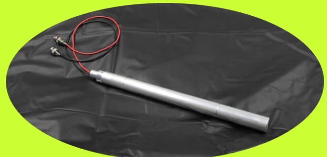
He-3 compatible detector module