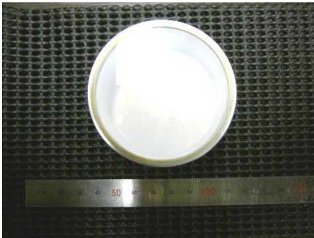
View of packaged single crystal grown via H-01