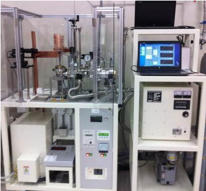
Photograph of Crystal puller H-01